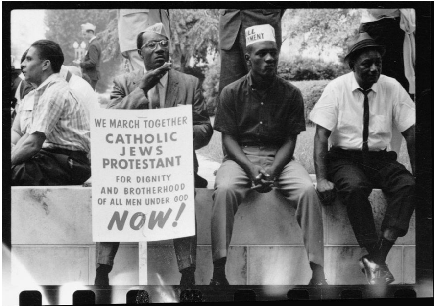
[The civil rights march from Selma to Montgomery, Alabama in 1965] [The civil rights march from Selma to Montgomery, Alabama in 1965]

Have students pretend they are members of a community in which Jim Crow laws exist. Tell them to pretend they have seen both of these images in the newspaper along with images similar to ones they found in their research. Ask them to express their opinion through a letter to the newspaper's editor regarding the issue of civil rights and Jim Crow laws, citing specific examples of Jim Crow laws. Although they are expressing an opinion, tell them they must display some type of understanding behind the emotions that were felt on both sides of the issue.