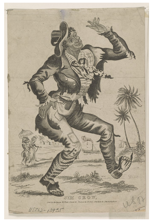
<u>Iim Crow</u> [between 1835 and 1845?]