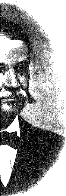
House of Representatives from

the Civil War tended to live on small, own slaves. The poor and yeoman non-East Tennessee farms worked hard to and they relied on their families for ty remembered that his mother "did [d] weaving [of] all the cloth for the their mothers, and sons sometimes nally, impoverished wives worked as