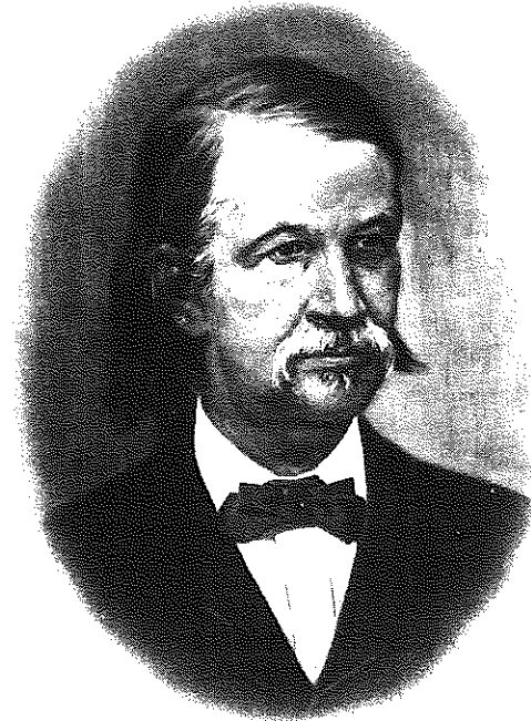
Horace Maynard, member of the U.S. House of Representatives from Tennessee and outspoken Unionist.