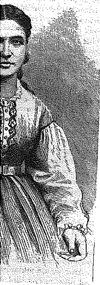
a "true heroine."

pleading for her father's life. Her for Davis pardoned Self two hours