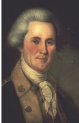
Gov. John Sevier

http://www.johnsevier.com/bio_johnsevier.html