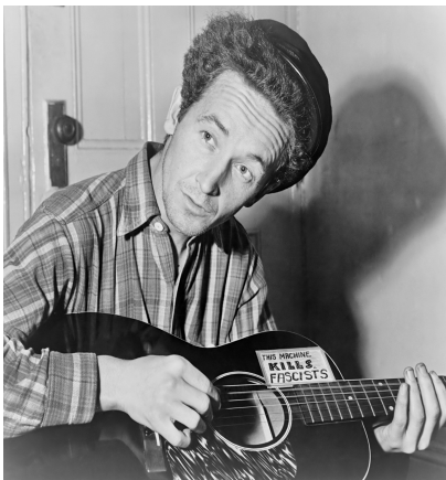
Folk Singer Woody Guthrie