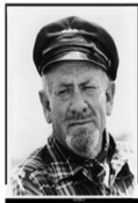
Novelist John Steinbeck