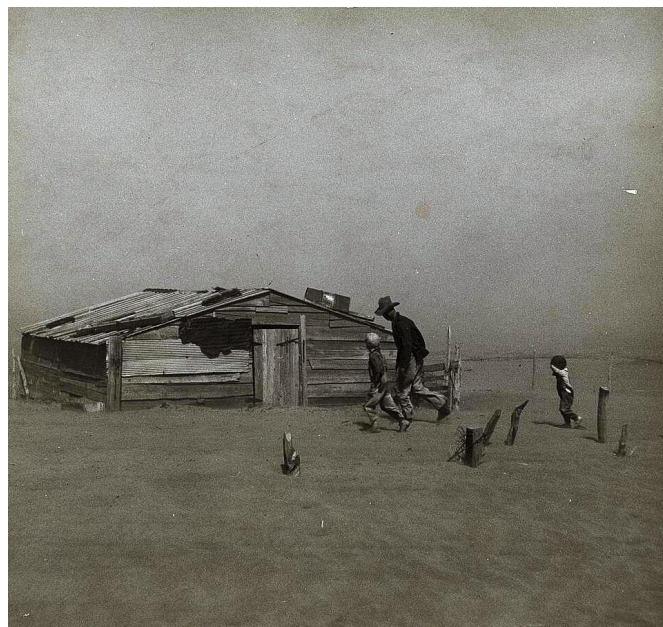
Farmer and sons walking in the face of a dust storm. Cimarron County, Oklahoma, April 1936