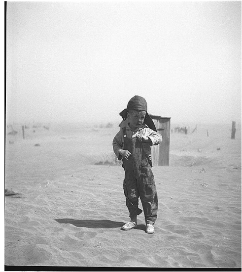
Son of Cimarron County, Oklahoma farmer April 1936

http://www.weru.ksu.edu/new_weru/multimedia/dustbowl/dustbowlpics.html