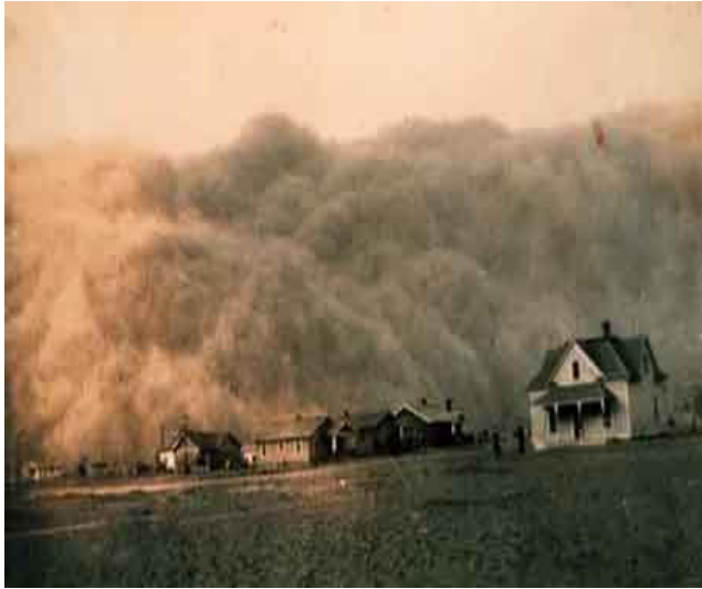
Dust storm approaching Stratford, Texas. April 18, 1935

http://www.weru.ksu.edu/new_weru/multimedia/dustbowl/dustbowlpics.html