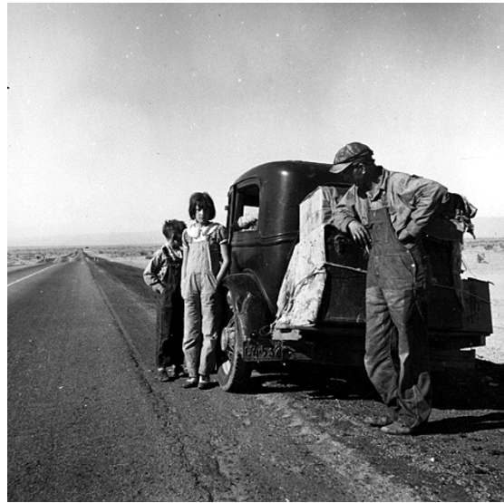
Oakies stalled in California, Feb. 1937