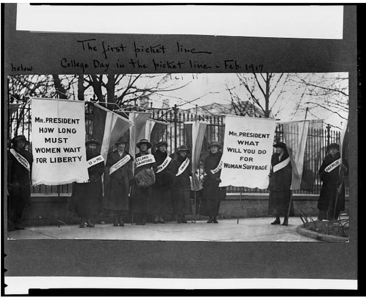
First Day of the Picket Line in front of the White House, Feb. 1917, Library of Congress

Both the suffragists and the president increased pressure on those opposed to the bill. President Wilson told the Senate that "the democratic reconstruction of the world will not have been completely or adequately obtained until women are admitted to the suffrage." Wilson regarded "the concurrence of the Senate in the constitutional amendment proposing the extension of the suffrage to women as vitally essentially to the successful prosecution of the great war of humanity in which we are engaged." The world is watching us, Wilson added, "looking to the great, powerful, famous democracy of the West to lead them to the new day... and they think, in their logical simplicity, that democracy means that women shall play their part in affairs alongside men and upon equal footing with them. If we reject measures like this, in ignorance or defiance of what a new age has brought forth, they will cease to follow or to trust us." Echoing the arguments of progressive reformers to grant the right to vote to women, Wilson concluded, "we shall need their moral sense to preserve what is right and fine and worthy in our system of life as well as to discover just what it is that ought to be purified and reformed. Without their