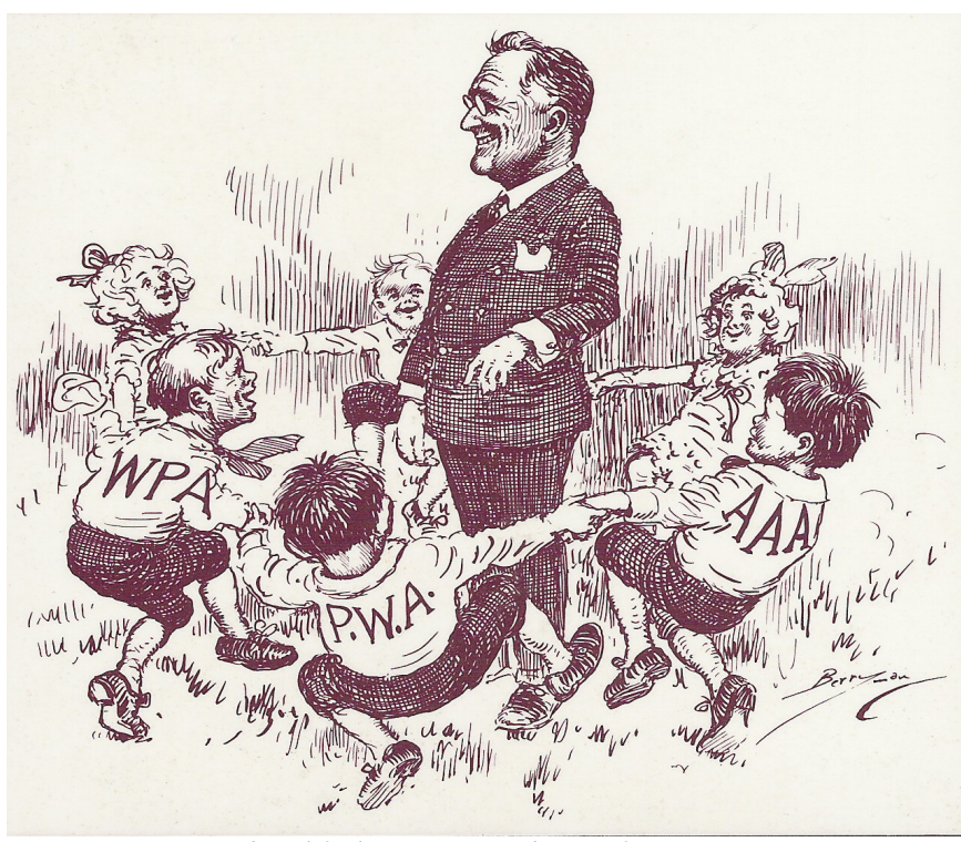
Cartoon by Clifird Berryman (Library of Congress)

The New Deal had countless programs, labeled an "alphabet soup" by its critics. Among the New Deal acts were the following, most of them passed within the first 100 days of Roosevelt's Administration. Most were abolished around 1943; others remain in operation in 2007: