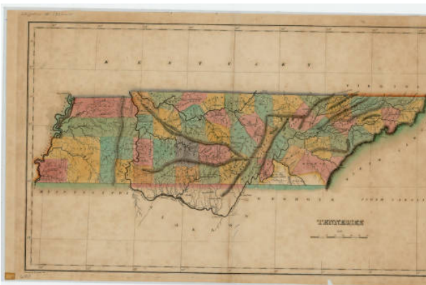
Tennessee Map, circa 1822