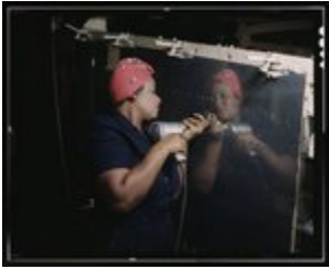
Operating a hand drill at Vultee-Nashville, woman is working on a "Vengeance" dive bomber, Tennessee