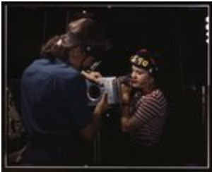
Two women employees of North American Aviation, Incorporated, assembling a section of a wing for a P-51 fighter plane