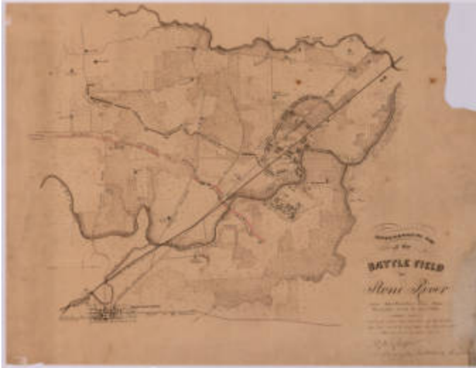
Stone's River Map

The following source is available from the Tennessee State Library and Archives. Click on the link and then chose the download option at the upper right to download a copy.