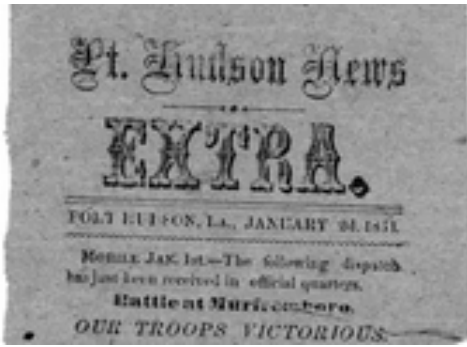
Article on Stone's River From Fort Hudson L.A. newspaper

Transcription is available by clicking on the image and then selecting "full text" at the top.