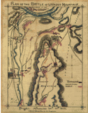
Plan of the Battle of Lookout Mountain. Fought November 24th-25th, 1863.