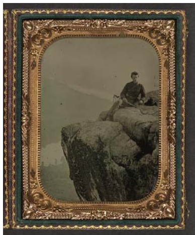
Unidentified soldier in Union officer's uniform at Point Lookout, Tennessee, sitting with cavalry saber in hand and slouch hat resting beside him on a rock