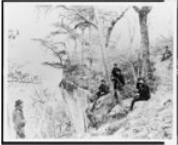
General Ulysses S. Grant and five other men on Lookout Mountain, Tennessee