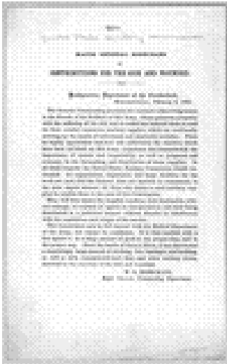
Major General Rosecrans on contributions for the sick and wounded

Transcription is available by clicking on the image and then selecting "full text" at the top.