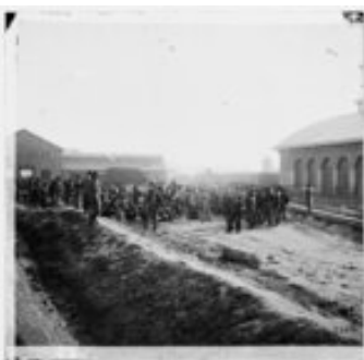
Chattanooga, Tenn. Confederate prisoners at railroad depot