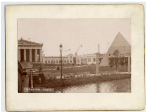
General view of Tennessee Centennial

A number of additional sources are available at http://teva.contentdm.oclc.org/cdm/landingpage/collection/Centennial