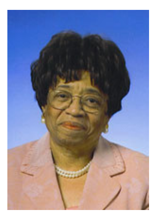
Democratic Representative Tommie Brown (Dist. 28, Hamilton County)