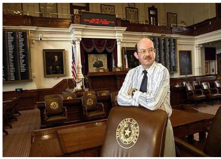
Gregory Watson Courtesy of www.post-gazette.com

1870 act to reject the 15<sup>th</sup> Amendment from the official record. The joint resolution resolved that the 1870 measure is "hereby revoked, repealed, and utterly rescinded." Subsequently, all remaining members of both chambers of the General Assembly added their names to the joint resolution as cosigners. On April 2, 1997, the Tennessee General Assembly took a very historic and symbolic action by officially post-ratifying the 15<sup>th</sup> Amendment, 128 years after the amendment was first rejected by the state legislature. Six days later, in an official ceremony at the state capital, Tennessee Republican Governor Donald K. Sundquist signed House Joint Resolution 32, thereby making Tennessee the 37<sup>th</sup> and final state to ratify the 15<sup>th</sup> Amendment.